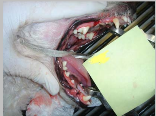
Teeth after cleaning