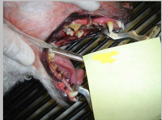
Teeth before cleaning

Bacteria and plaque-forming foods can cause build-up on a dog's teeth. This can harden into tartar, possibly causing gingivitis, receding gums and tooth loss. One solution? Regular teeth cleanings, of course.